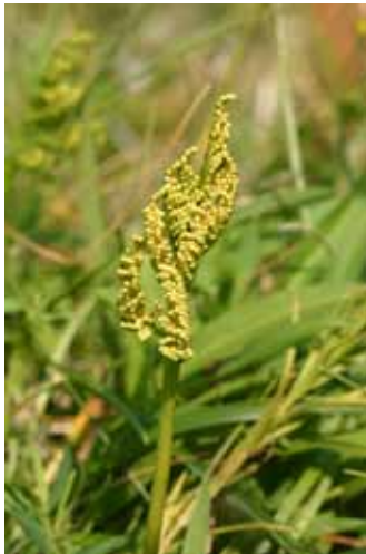
Botrychium multifidum , leathery grapefern, an unusual plant found on the lakeshore at Lake Wenatchee State Park

Conducted for The Washington State Parks and Recreation Commission PO Box 42650, Olympia, Washington 98504