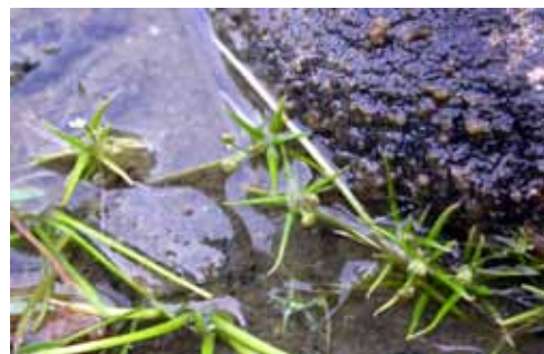
Awlwort, emerging from the receding waters of the Wenatchee River in August, 2004.

246 vascular plant species were identified in the park, expanding on the 80 plant species known from a more cursory inventory conducted in 1992. One plant species that is listed with the Washington Natural Heritage Program (WNHP) as a 'Sensitive- Not Yet Ranked' (SNR), awlwort ( Subularia aquatica ), was found in the course of the project. We are informed by the WNHP that this is the only currently