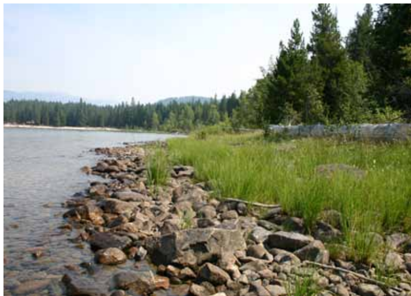
The southwest shore of Lake Wenatchee, in Lake Wenatchee State Park. The wetland vegetation visible between the large log on the right and the lake shore appeared in late June and July as the water level of the lake dropped.

27 alien plant species were counted in the park, which is 11% of the 245 total known species. Virtually all of the alien species are ones that are ubiquitous in the western states. Most require