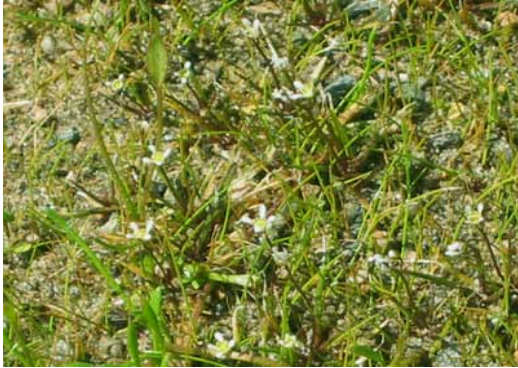
Awlwort in its aquatic habitat