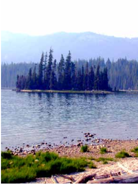
Emerald Island, which lies within the park boundaries. Among the plant species that emerge on the shoreline as the lake water recedes is leathery grapefern, Botrichium multifidum , pictured on the report cover.