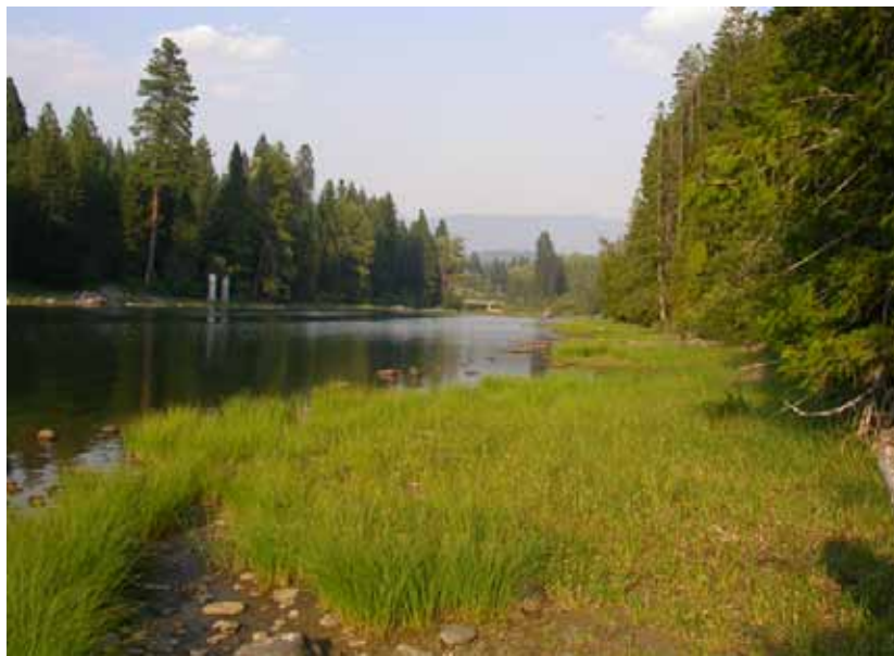
The south shore of the Wenatchee River, just downstream from Lake Wenatchee. The river ran at the forest edge (right side of image) in June; by August the wetland plant community pictured had emerged from the receding water.

known population of this species in the state. In Lake Wenatchee State Park it occurs along the south shore of the Wenatchee River at the outlet of the lake, and downstream along the shore for 200 yards. It is part of an unusual community of wetland plants that only begin their growth cycle after the water in the lake and along the riverbank begins to drop in June. Many of these species are not in bloom until late July or early August.