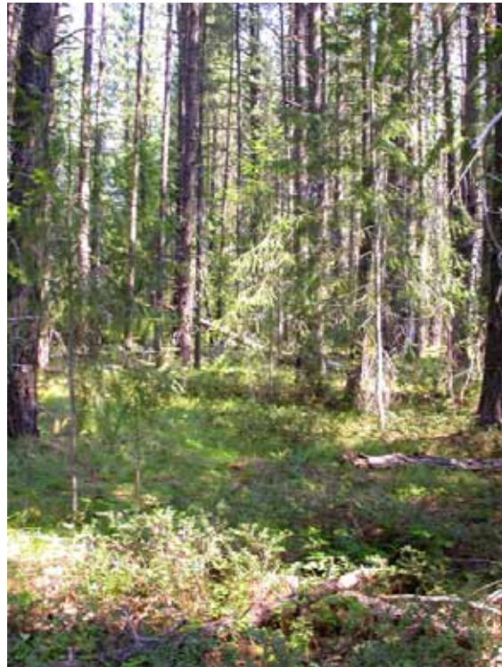
Coniferous forest covers much of Lake Wenatchee State Park. Typically Douglas-fir dominates the stands, although the plant community will often key to the grand fir series because of younger trees of this species growing in the understory.

disturbed, sunlit ground on which to thrive. Thus most are excluded from the forested areas, and are found primarily in the highly disturbed areas in the park, such as along roadways and in and around the campgrounds.