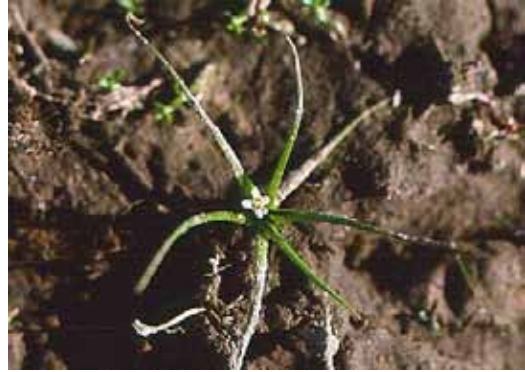
Awlwort emerging from shallow water

Occurrence in Washington: This is the only current record of Subularia aquatica in the state.