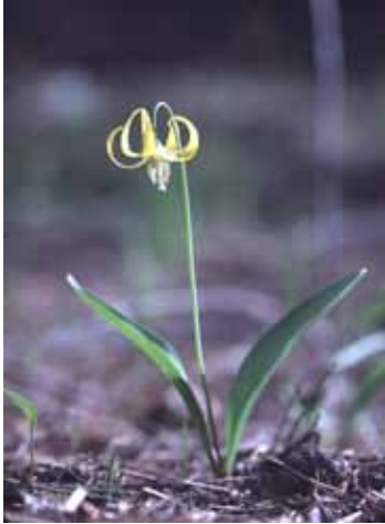
Yellow avalanche lily, Erythronium grandiflorum , one of the first flowers to bloom at Lake Wenatchee State Park.

A comprehensive rare plant inventory and plant community vegetation survey was conducted in Lake Wenatchee State Park by a team of 2 professional botanists and 2 Geographic Information Systems (GIS) technicians during the spring and summer field season of 2004. Much of this 323 acre state park is covered by second growth coniferous forest, but the park also includes several thousand feet of lake shore along Lake Wenatchee, a half acre island, and two thousand feet of shoreline along the Wenatchee River as it leaves the lake. The habitat bordering the lake and river form botanically complex wetlands in mid-summer, as the water level drops, adding considerably to the botanical and biological diversity contained in the park.