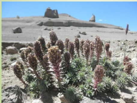
Nassauvia sp.