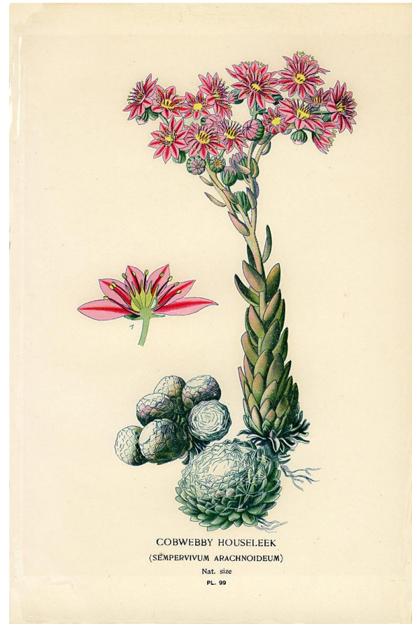
COBWEBBY HOUSELEEK (SEMPERVIVUM ARACHNOIDEUM)