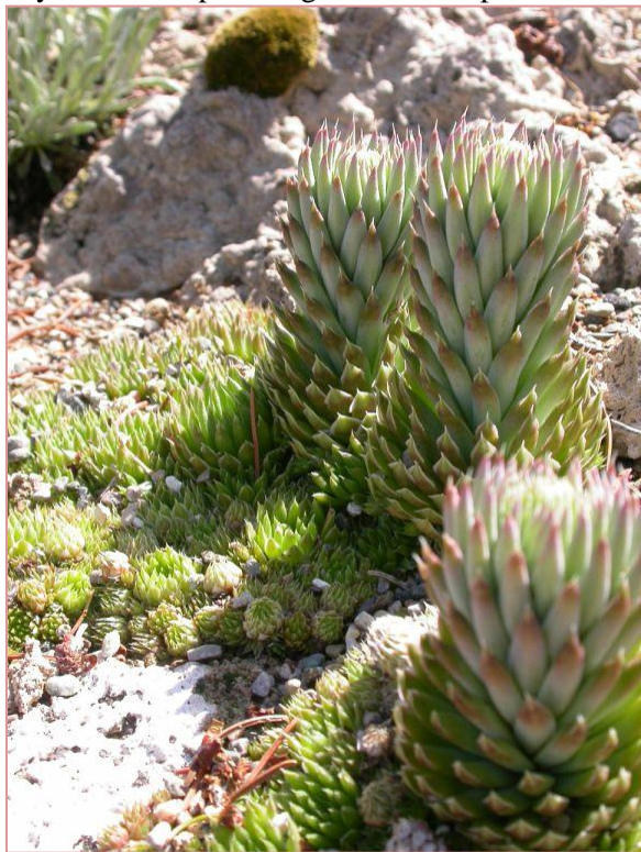
Orostachys minuta