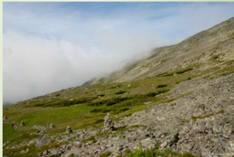
Alpine Garden Trail on Mt. Washington

AM: Al Martin - Mt. Washington – A Photographer's Journey