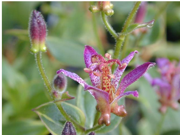
Tricyrtis formosa 'Samurai'