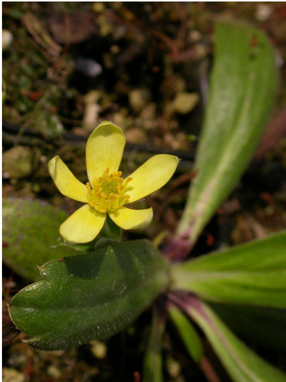
Anemone trullifolia v. linearis

Going out-of-range, consider Ranunculus kochii from the drier mountains of Central Asia. I think this came from the Czech's some 15 years ago when Andrew Osyany operated Karmic Exotic Seeds. They came as tubers – small enough to fit in with the other seeds. Again, it is a plant that emerges with the melting snow – it is one of the first flowers in our garden, often appearing in late March/early April. Flowers come first and are a very bright, deep yellow which attracts the few bees and flies that brave the cold. Of course in its native habitat, it must grow early and quickly, for soon there will be no moisture, and all will be desert. By June the leaves have matured and wither away. Lifting the plants then or later before frost, one can separate the little tubers much as one would do with Dodecatheon spp. A logical way to set off the plant would be to put it in a mat of Arenaria spp. or Gypsophila aretioides . The mat would also help to shield the roots from excess water and heat.