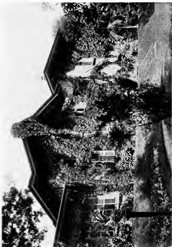
THE HOME, CUYAHOGA FALLS, OHIO