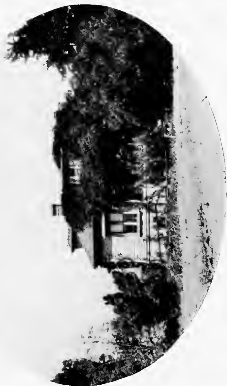
HOME OF EDWARD R. SILL, BERKELEY, CALIFORNIA