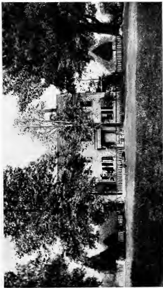
BIRTHPLACE OF EDWARD R. SILL, WINDSOR, CONNECTICUT