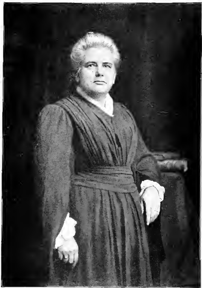
REVEREND ANNA HOWARD SHAW IN HER PULPIT ROBES