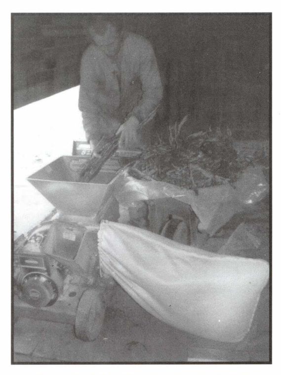
Figure 7: Shredding Laminaria digitata.

The association plans to target the food and pharmaceutical industries which utilize low volume, high valued products.