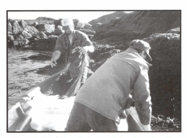
Figure 2: Harvesting Alaria around shoreline at low tide.