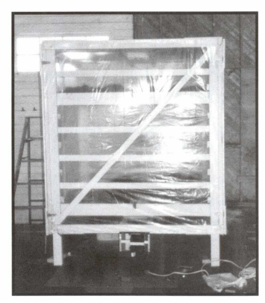
Figure 6: Finishing dryer.

The finishing dryer was a makeshift mechanical dryer constructed from wood (see Figure 6). It was 6' x 6' x 8' high, painted and covered in plastic. Racks were made of monofilament netting or window screen. Hot air from a ceramic heater located under the dryer was piped into the dryer and circulated using a hot air furnace blower. An exhaust fan located at the top of the dryer piped out moisture from the drying seaweed. Temperature inside the dryer was regulated at 68 to 75 degrees Fahrenheit. Semi-dried seaweed (280 lbs/load) was placed in the dryer overnight to reach the desired moisture content of 10 to 13%.