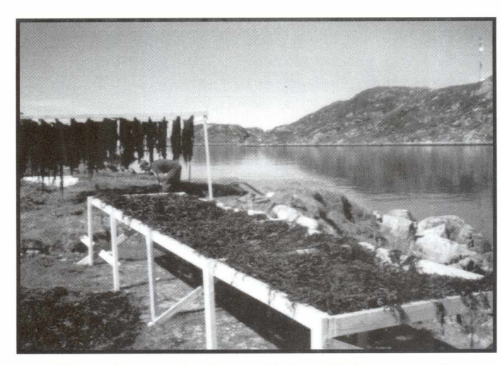
Figure 5: Ascophyllum on flakes; Digitata on racks.

A finishing dryer was used to dry products down to 10 to 13% moisture so products could be later shredded or ground.