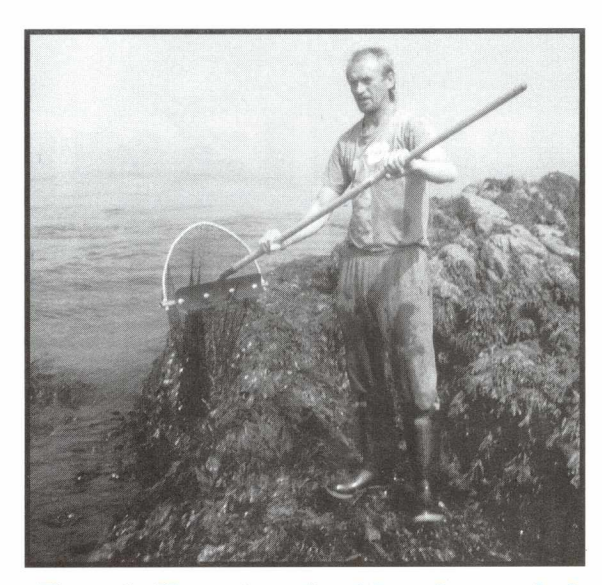
Figure 1: Harvesting rake with net bag attached.

Divers were used to tag and measure plants at two sites on the north side of Ramea Island as a means of measuring growth rates (see Figure 3). One hundred and thirty-two plants were tagged in